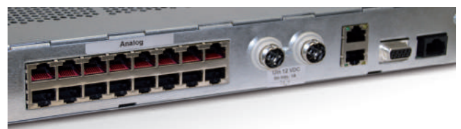
Back panel with analogue connection unit (RJ45), redundant power supply connection, 2 LAN ports, audio output and alarm contacts