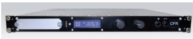
VoiceCollect® CFR Digital Recorder