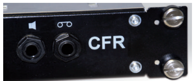
Audio output for loudspeaker and headphone on front panel